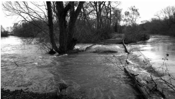
(The River Loddon and Canberra Lake in

The role of the Community Flood Warden is primarily one of communication, and there are many ways in which a Community Flood Warden can help their local community in times of flood.