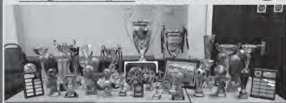
Our collection of cups, trophies and medals from pre-Covid19 season