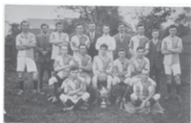
Photographic postcards relating to Twyford events of almost a 100 years ago